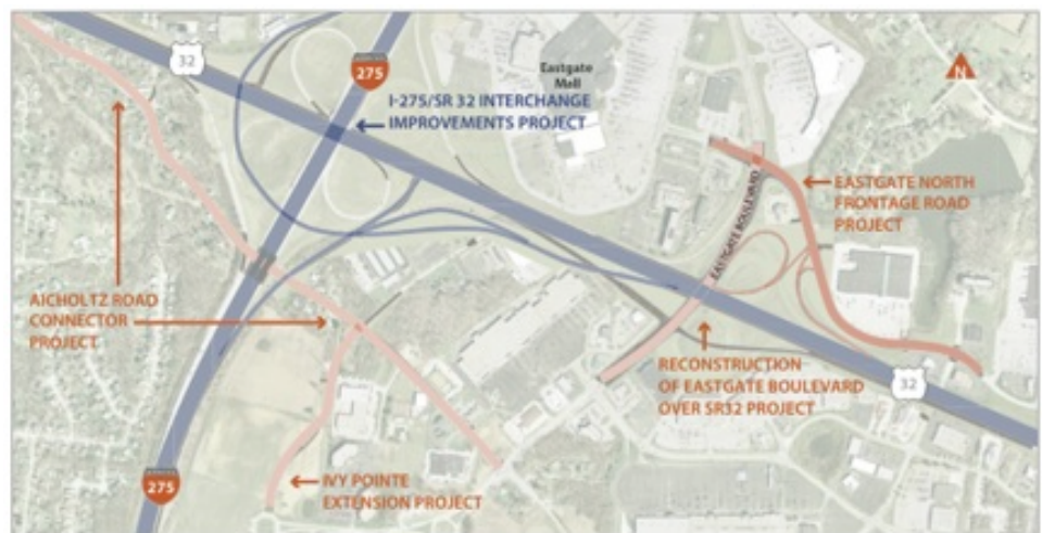
I-275/SR 32 Interchange Improvements Map

Click here to read the full statement from ODOT, including lane closures, detours and traffic impacts.