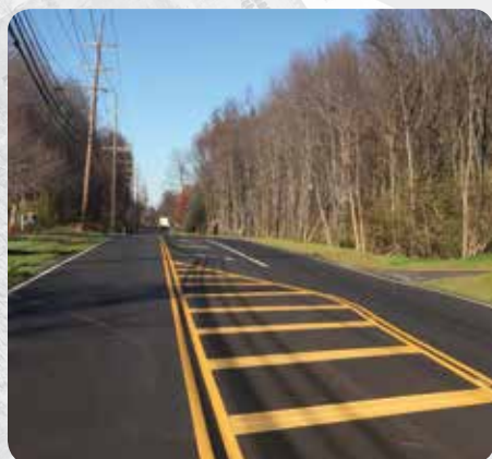
Widening & new turn lane on McMann Road

Three roadway projects – at the Merwin Ten Mile Road intersection with SR 125, on McMann Road, and on East Tech Drive at the intersection of Old SR 74 – are now complete. Following the roadway improvements and planned local business expansions – which would not have been possible without the infrastructure upgrades – the three companies will collectively employ nearly 1,400 people.