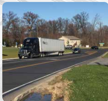
Widening & new turn lane at the Merwin Ten Mile Intersection with SR 125