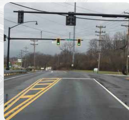
Widening, new turn lane and signal improvements at East Tech Drive & Old SR 74