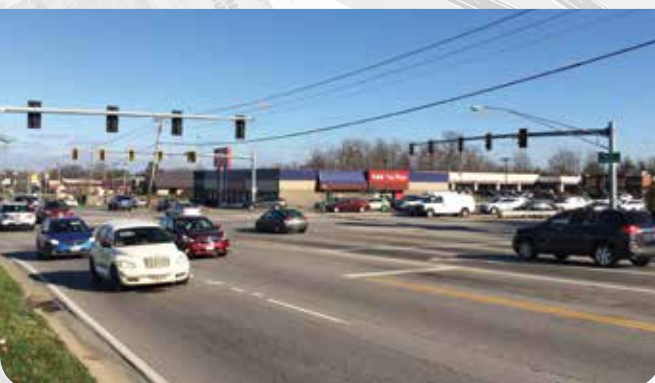
Traffic at SR 32 & Glen Este-Withamsville Road

The second phase of work became known as Segment IVa – from Eastgate to Batavia – and is now the area of focus.