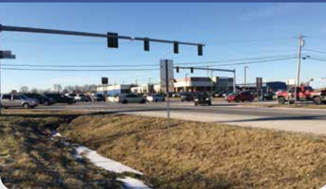
Traffic moving through the SR 32/Elick Lane intersection

Plans to improve travel from Eastgate to Batavia are being addressed in what's referred to by our project team as "Segment IVa" of the Eastern Corridor Program of Projects (I-275/SR 32 was Segment IV).